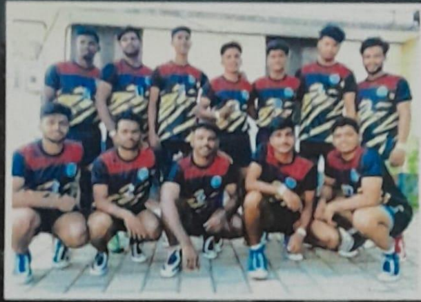
ASSABAH COLLEGE (Valayamkulam)