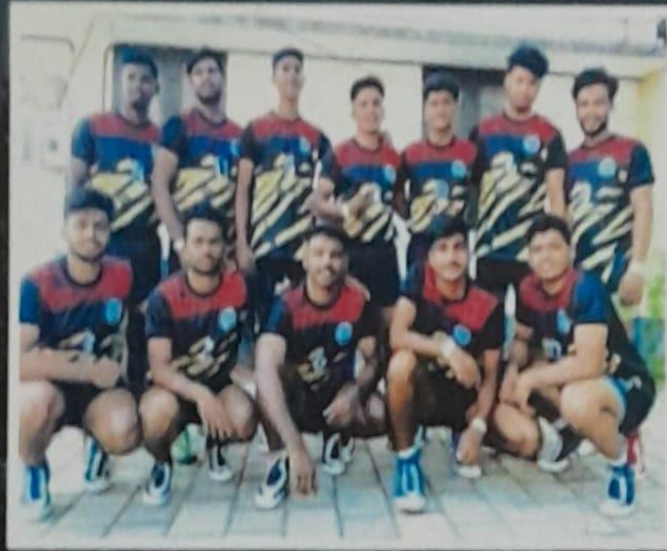
ASSABAH COLLEGE (Valayamkulam)